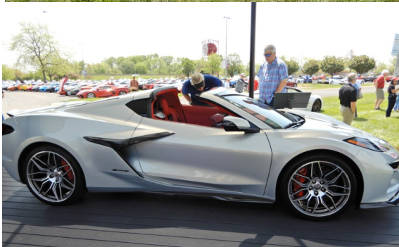
2023 ZO6's at The Bash, Bowling Green