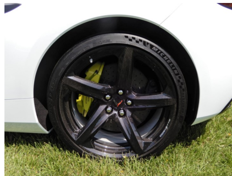
Carbon Fiber wheels = $$$$$