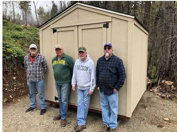
4-18-22 Another shed completed