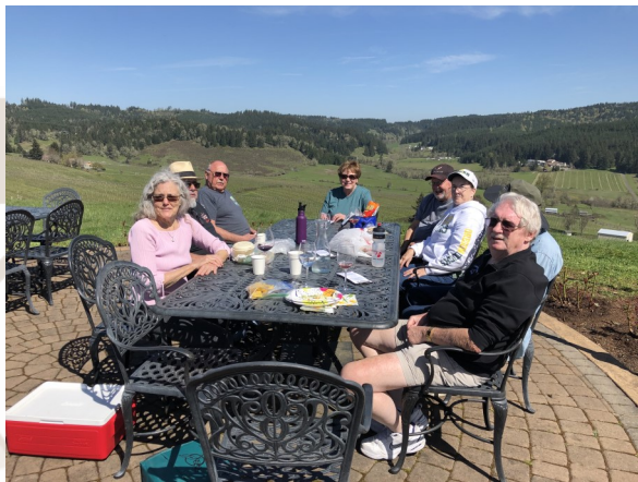
4-7-22 Sweet Cheeks Winery