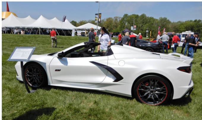
White Pearl 70th Anniversary