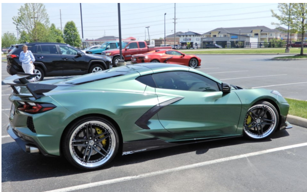
A GREEN C8 - just what I have been asking for!