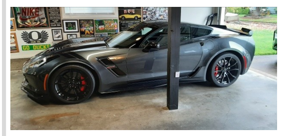
(rainy day garage photo)

Congratulations to Bill & Nancy Schrieber who recently purchased a 2017 Watkins Glen Gray Grand Sport coupe with less than 4300 miles.