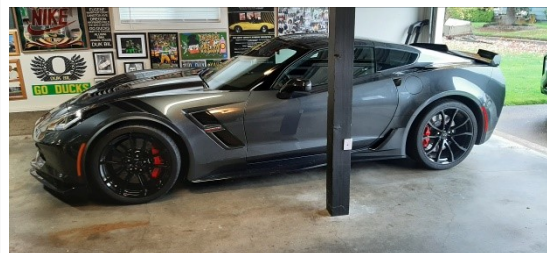
(rainy day garage photo)

Congratulations to Bill & Nancy Schrieber who recently purchased a 2017 Watkins Glen Gray Grand Sport coupe with less than 4300 miles.