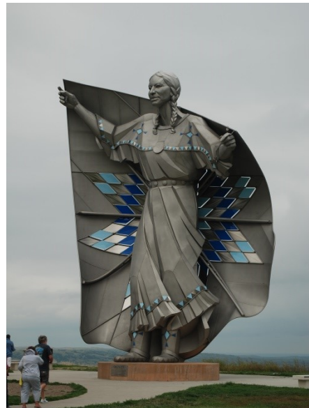
"Dignity" statue near Chamberlain, SD