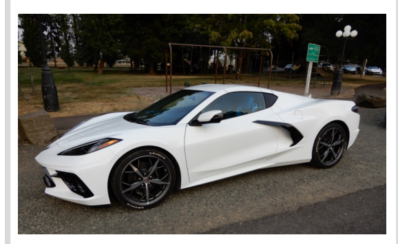
Craig & Terri Smith live in Coburg and drive this 2021 Arctic White coupe with Tension/Twilight Blue interior