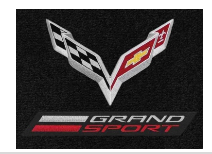
Welcome Our New Members