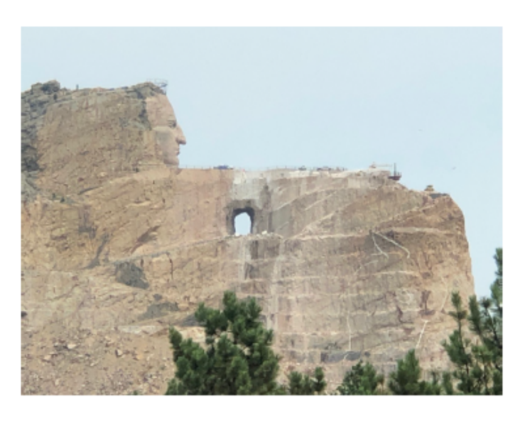
Mt. Rushmore and Custer State Park. We spent a whole day at the impressive Crazy Horse Monument and museum.

From the Black Hills we headed west through the Big Horn National Forest, WY, then into Cody, WY. We ate lunch at the old Irma Hotel and visited the Buffalo Bill Center which houses 5