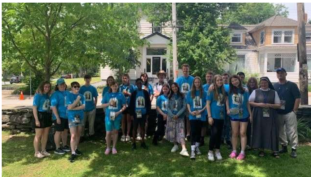
A picture of our Parish young people, youth leaders and chaperones who attended Steubenville Atlantic in July.