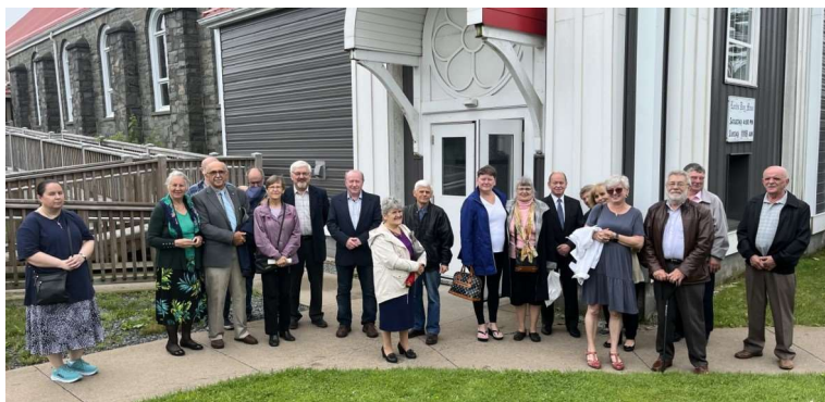
A picture of some parishioners from the Polish community after Mass at St Mother Theresa Church.