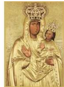
Our Lady of Zarvanytsia

Hear our prayers, O Lord, and deliver us from distress, for You are merciful and compassionate and love mankind. To You we give glory: the Father, the Son, and the Holy Spirit, now and forever and ever. Amen.