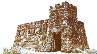
SMOKY VALLEY HISTORICAL ASSOCIATION LINDSBORG, KANSAS 67456