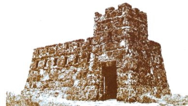
SMOKY VALLEY HISTORICAL ASSOCIATION LINDSBORG, KANSAS 67456