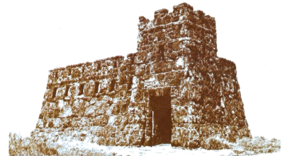
SMOKY VALLEY HISTORICAL ASSOCIATION LINDSBORG, KANSAS 67456