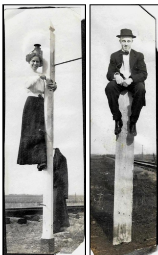
Bethany students having fun with (new) telephone poles.

As you can see in the previous page 1907 photo uniforms were quite elaborate, well fitted and easily recognizable. Lindsborg was one of the most well dressed fire companies in rural Kansas.