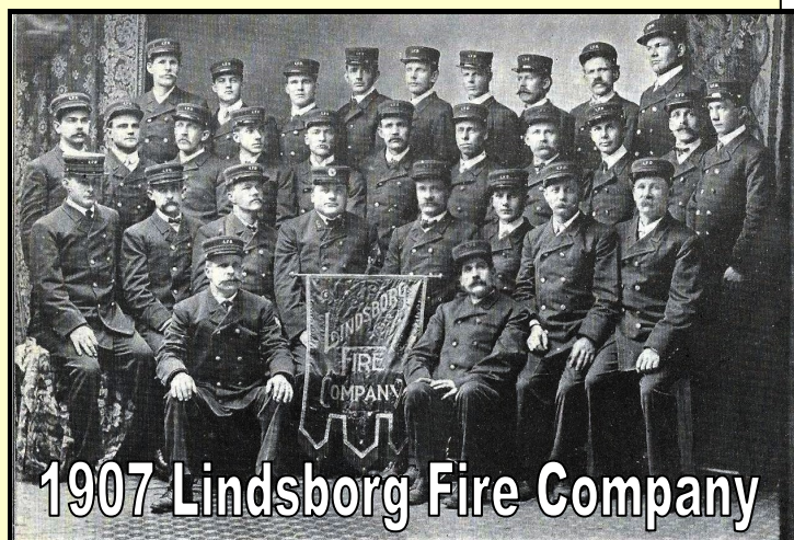
1907 Lindsborg Fire Company