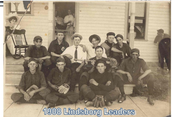
1908 Lindsborg Leaders