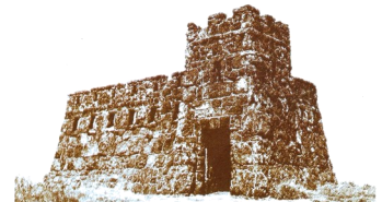
SMOKY VALLEY HISTORICAL ASSOCIATION LINDSBORG, KANSAS 67456

Check our Facebook page for the most up-to-date information concerning the Smoky Valley Historical Association.