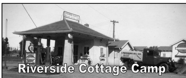
Riverside Cottage Camp