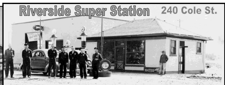
Riverside Super Station 240 Cole St.