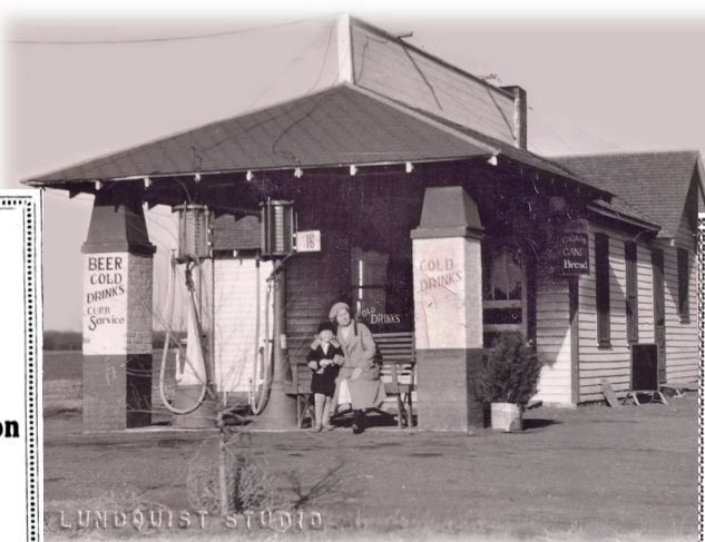
Emma Ahlstedt and (possibly) grand daughter Elly (Ahlstedt) Ostlind c1944 at filling station