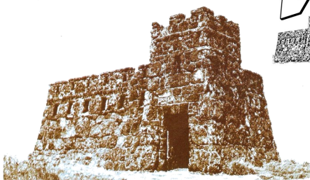
SMOKY VALLEY HISTORICAL ASSOCIATION LINDSBORG, KANSAS 67456