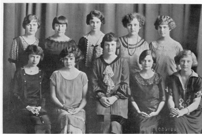
School Arts Society "The Sketchin' Kats"