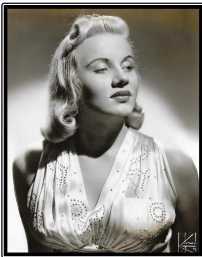
Astrid Neilson Press Photo c1955