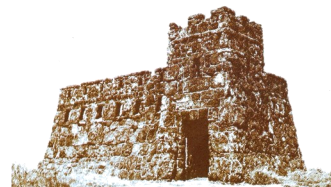
SMOKY VALLEY HISTORICAL ASSOCIATION LINDSBORG, KANSAS 67456