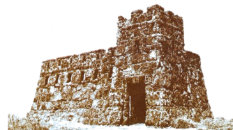
SMOKY VALLEY HISTORICAL ASSOCIATION LINDSBORG, KANSAS 67456