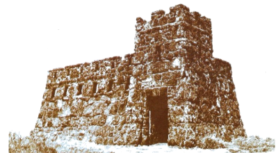
SMOKY VALLEY HISTORICAL ASSOCIATION LINDSBORG, KANSAS 67456