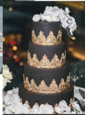
Midas Touch Channeling opulent 1920s style, the bride and