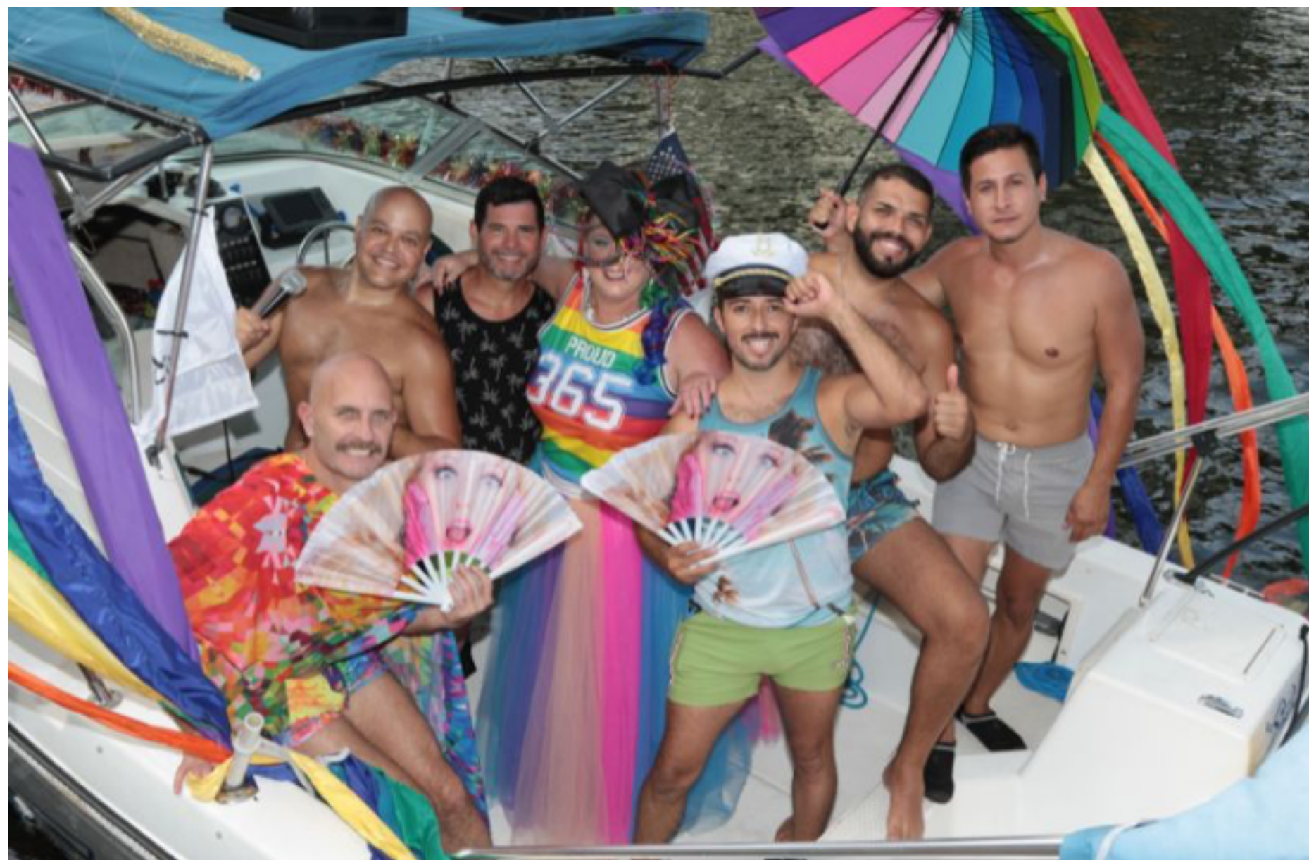
FLoatarama 2021.