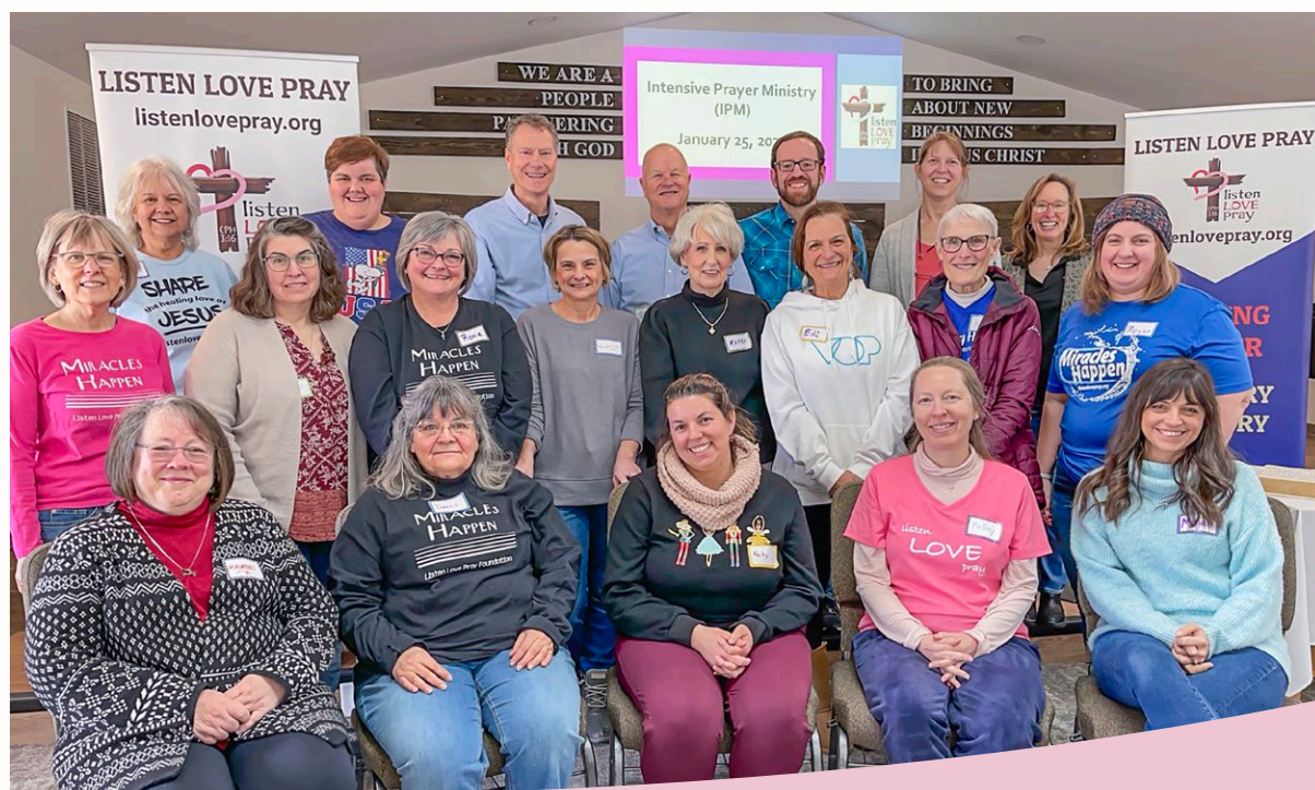
Participants from January's Intensive Prayer Ministry