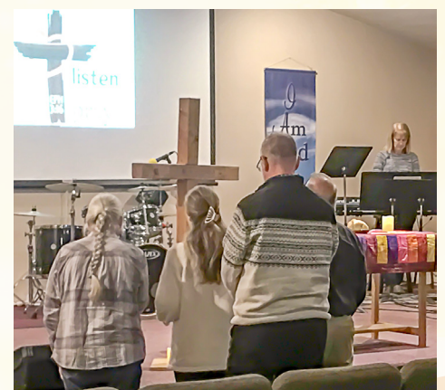
Selected pictures from the November Special Healing Prayer Service with communion and oil anointing