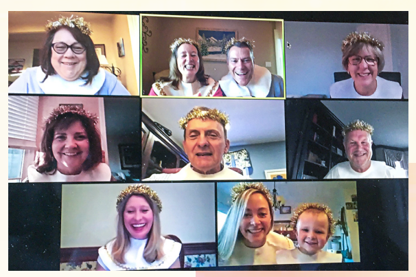
LLP's Board of Angels... we mean... Directors.

As part of our campaign, we hope you will pray on giving a financial gift to support our life-giving work for Jesus. Donate at <u>Listenlovepray.org</u> or send your gift to: LLP, 8555 Dollyhyde Road, Union Bridge, MD 21791