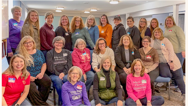
Sharing Love via Deep Healing Training for Gettysburg 4-square