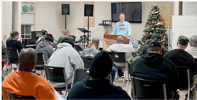
Sharing Love on Sunday Nights at Frederick Rescue Mission