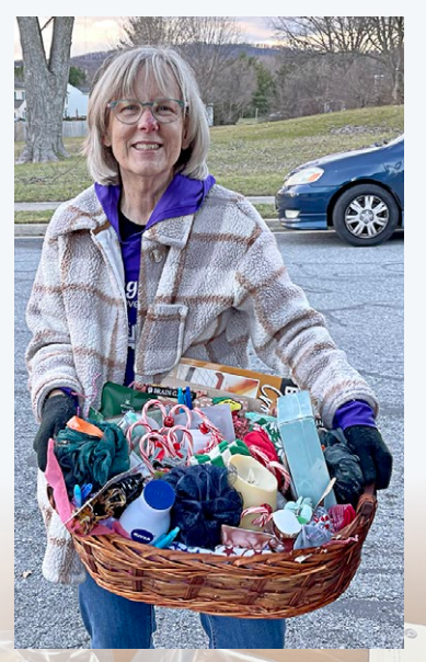
LLP's recent Christmas visit to Solid Ground Recovery.