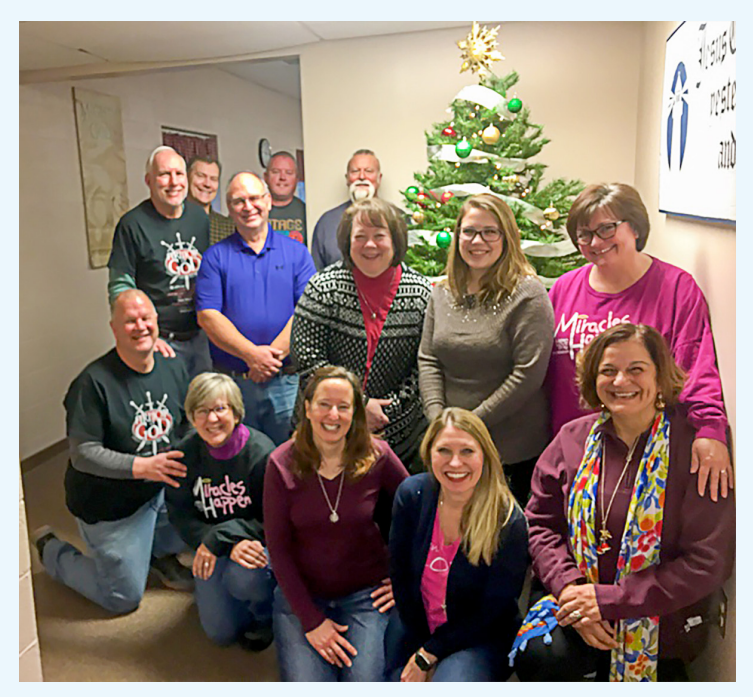
LLP at Frederick Rescue Mission (above) LLP table at Healing Prayer Workshop Level 4 (left)