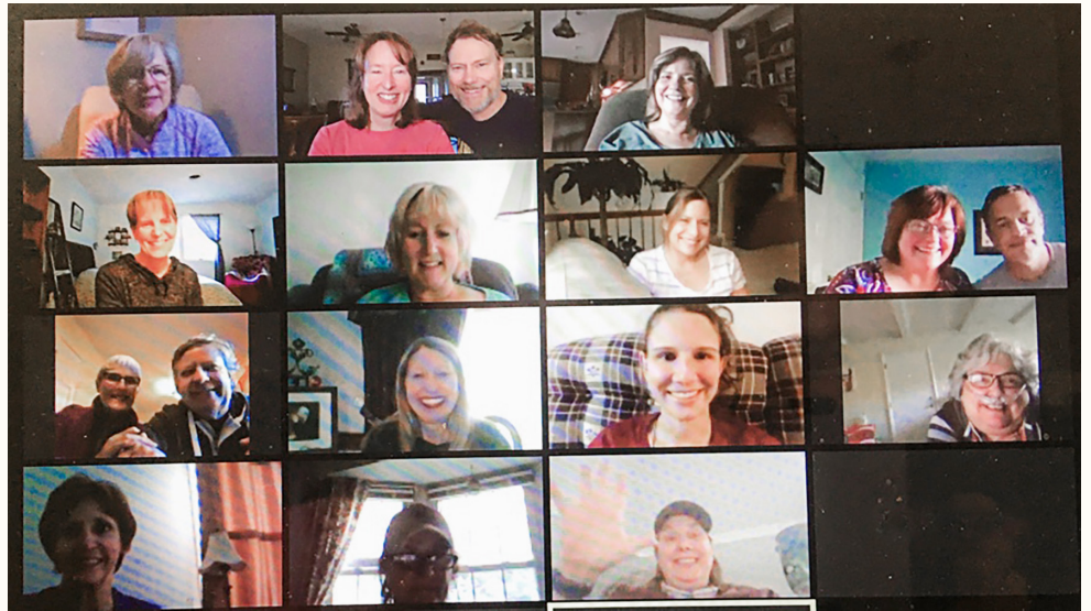
Participants in one of LLPs Zoom soaking-prayer services on Tuesday nights.