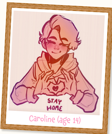
Caroline (age 14)