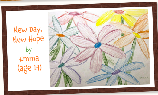
New Day, New Hope by Emma (age 14)