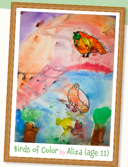
Birds of Color by Aliza (age 11)