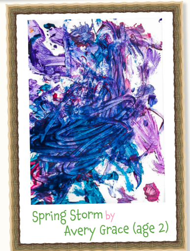
Spring Storm by Avery Grace (age 2)