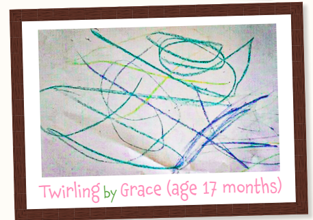
Twirling by Grace (age 17 months)

Whenever the rainbow appears in the clouds, I will see it and remember the everlasting covenant between God and all living creatures of every kind on the earth. —Genesis 9:16