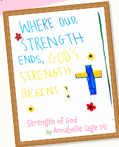
Strength of God by Annabelle (age 14)