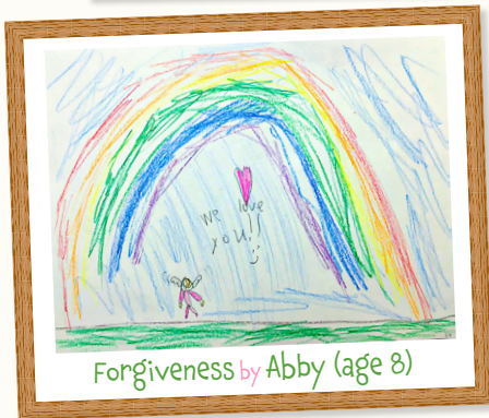
Forgiveness by Abby (age 8)

Whenever the rainbow appears in the clouds, I will see it and remember the everlasting covenant between God and all living creatures of every kind on the earth. —Genesis 9:16