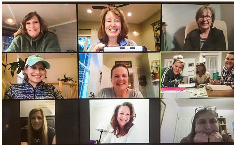
The LLP weekly, Zoom bible study for residents of My Father's House, a recovery home for women in Mt Airy, MD. Using lessons from the Celebrate Recovery Bible, residents connect with others outside the recovery house and learn about Jesus. Time for individual Healing Prayer is offered after each Wednesday lesson time.