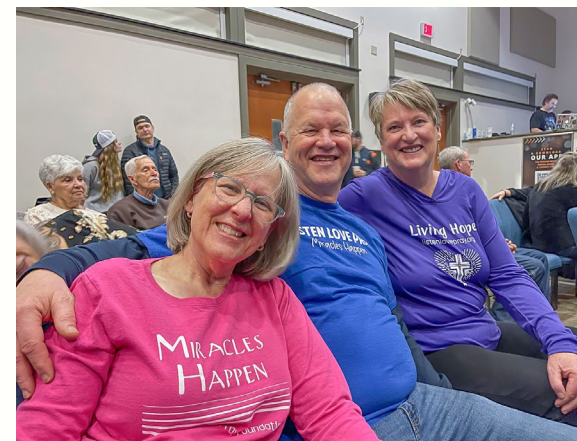
LLP volunteers representing the healing love of Jesus