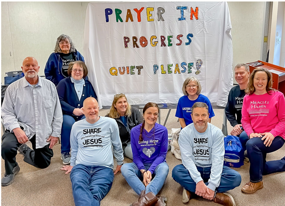
LLP's Deep-Healing team prayed for five amazing men (March 4, 2023)

LLP's Deep Healing goes along with a Life's Healing Choice where we choose to cooperate with God in His process of changing us . "Cooperate" means that we do something together – we have a role to play. Satan and his workers, demons, actively discourage our efforts to change.