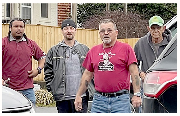
Some of the guys coming in to RICH

LLP hosts a meeting where men support each other in their long-term recovery on the last Wednesday of every month. Starting with dinner, then scripture-based teaching and prayer, men stay connected to Christ and each other. If you feel led to volunteer in men's recovery, contact <a href="mailto:tedlistenlovepray@gmail.com">tedlistenlovepray@gmail.com</a>. Training and mentoring available for all willing hearts.