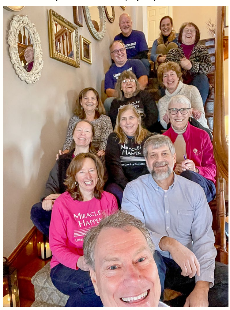
LLP volunteers getting ready to bring Jesus' LOVE to FRM Staff

On February 3<sup>rd</sup>, LLP was asked to lead the staff retreat's afternoon session. Aiming to bring the healing love of Jesus to FRM's hard-working people, LLP offered group and individual activities. In groups, LLP helped the staff meditate on scripture, receive inspiration from Holy Spirit and consider how to work from the overflow of God's love. Then, 5 teams of two prayer ministers each, offered individual healing prayer helping them step into the light and healing love of Jesus. What a thrill to be able to serve FRM's dedicated staff members who work tirelessly for our community in countless ways. LLP continues to pray for you all.