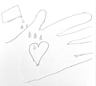
Jesus holding my heart, and something poured out on it.