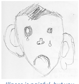
Illness is painful, but you are still with me, Lord.