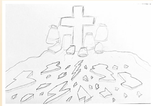
In August, LLP hosted an evening to sketch your prayers. Edi gave a wonderful lesson on prayerful sketching. Each participant received their own sketch book. After the group spent time sketching, anyone could come up and talk about their time sketching and praying.