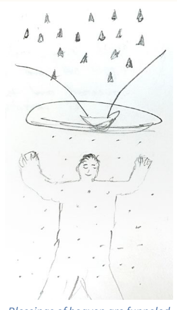
Blessings of heaven are funneled through an open heaven and released in a way I can receive them. They are all around me.