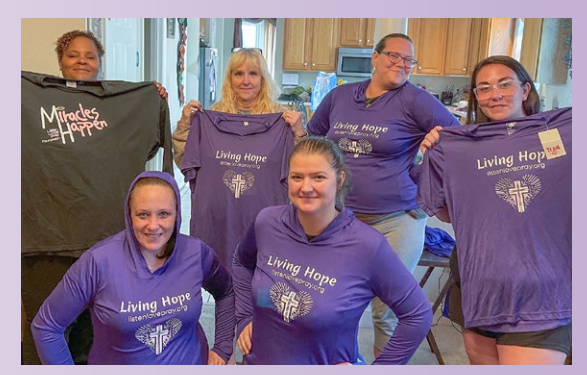
Ladies at Solid Ground Recovery represent Living Hope.

LLP prayer ministers work to support women at Faith House.