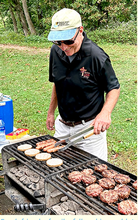
Food, friends, family, fellowship, and lots of FUN at the picnic!