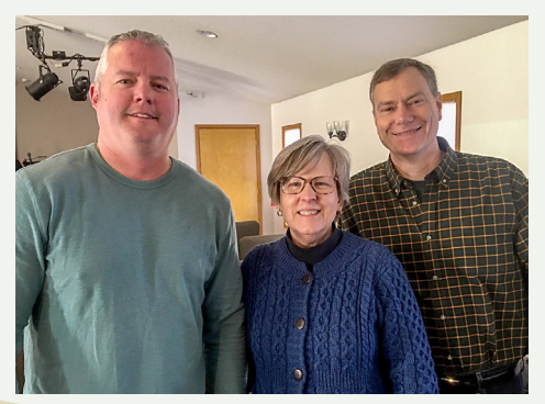
Healing prayer teams for the Saturday Blitz