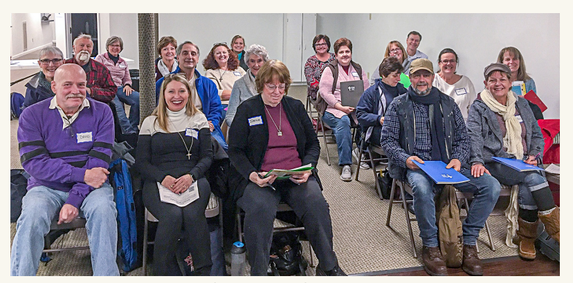
LLP Healing Prayer 1 class participants

Healing Prayer 1 class met Thursdays from 7-8 pm at New Beginning Nazarene Church. They covered Jesus' healing ministry and our commission as His disciples to do the same. HP1 is a time to learn as well as experience personal ministry. We build upon a biblical foundation and include lessons on Holy Spirit power, healing our image of God, 4 types of healing, and how to "listen, love, and pray" for healing.