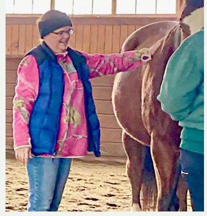
Patti: Not at all what I expected, but better. I felt drawn to slow down. Giving up control of time to something else. It was quite peaceful.