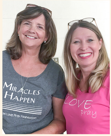
LLP prayer ministers praying at The Ranch and Beacon House