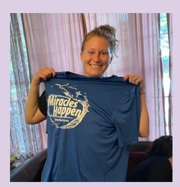
We are all on the Front Line of Recovery!