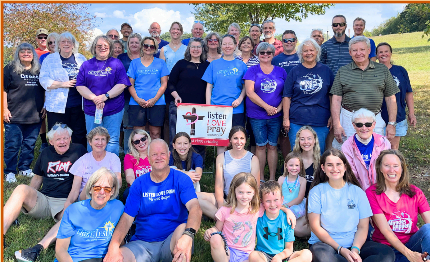
Our family of volunteers at the annual volunteer picnic