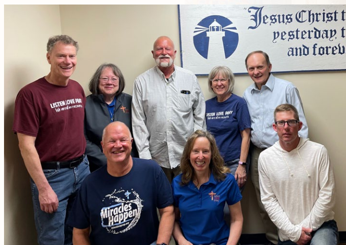
LLP team on March 23rd (top) and on March 30th