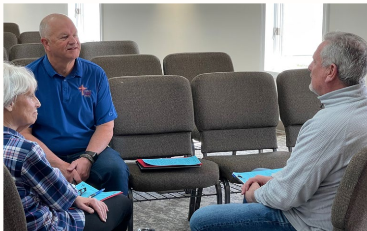
LLP prayer ministers and volunteers learn more about Healing Prayer and practice.