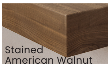
Stained American Walnut