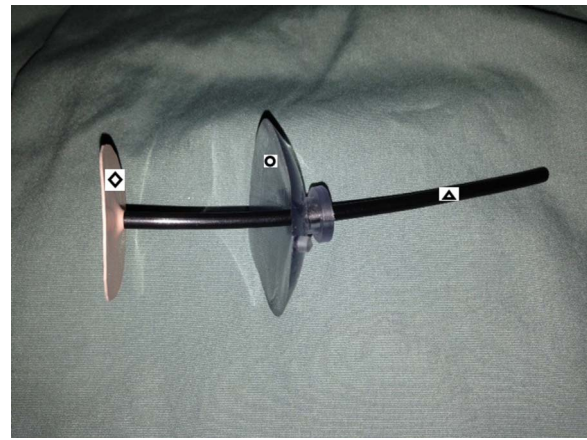
Figure 1 Components of the device: ○ silicone suction cup; ▲ flexible shaft; ◆ low-profile collapsible blood flow blocking membrane.

The new device is deployed by introducing the collapsible blood flow blocking membrane through the cardiac injury, and subsequently sliding the silicone suction cup down toward the injury on the surface of the heart (figure 2A). Thereby, abutting the membrane to the undersurface of the ventricle wall creating a firm seal (figure 2B). The device is seamlessly removed from the ventricle by sliding the suction cup upward along the plastic shaft, away from the surface of the heart, and pulling the device out of the wound. In contrast, the Foley balloon requires complete deflation before removal. The collapsible property of the inner blocking membrane maintains continuous control of the