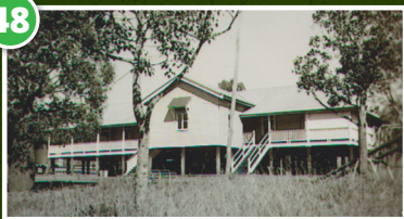
Proston State School opened July 1924.