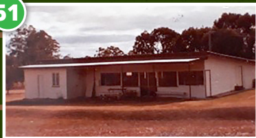
Proston Golf Course. Originally the site of a racecourse and a campdraft ground. The Proston Golf Club was formed in 1936.