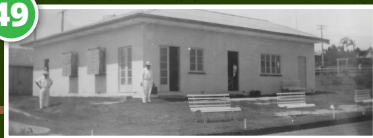
Proston Bowls Club was formed and operating by 1946.