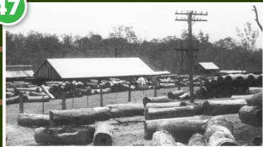
Railway Sleeper Mill operated from 1950 until approximately 1967.