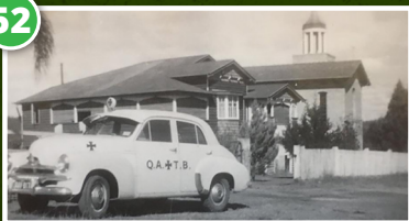
First Ambulance Sub-Centre opened 1951 at 22 Wondai Road.