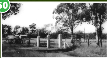
Proston Sports Reserve Grounds. First show held in 1958.