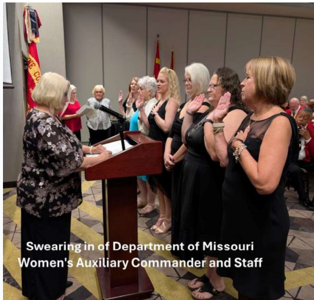
Swearing in of Department of Missouri Women's Auxiliary Commander and Staff