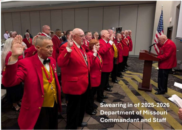
Swearing in of 2025-2026 Department of Missouri Commandant and Staff