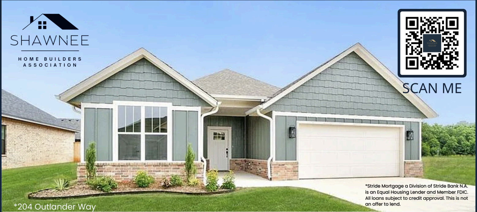
*204 Outlander Way

*Stride Mortgage a Division of Stride Bank N.A. is an Equal Housing Lender and Member FDIC. All loans subject to credit approval. This is not an offer to lend.