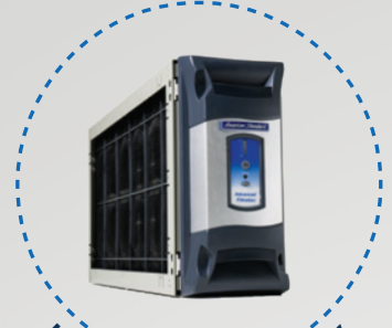
INDOOR AIR QUALITY