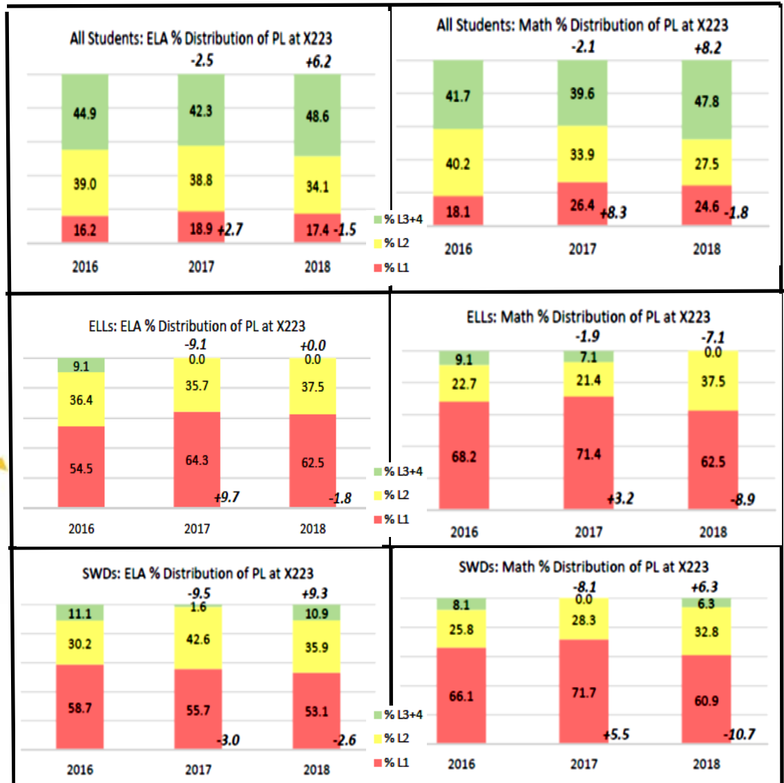
How Are Our Students Performing in ELA?