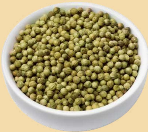
Whole Coriander Seeds

Sourced directly from India's finest farms, our coriander brings natural freshness, rich aroma, and authentic flavor straight to your kitchen. A staple in global cuisines, it enhances curries, pickles, spice blends, and seasonings. Our varieties include :