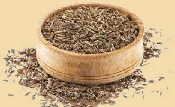
Semi Europe Cumin