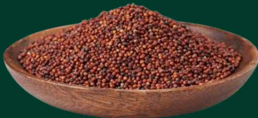
Finger Millet (Ragi)

Sourced from nutrient-rich Indian farms, our millets are a powerhouse of health, offering natural goodness in every grain. Known as “the grains of the future,” millets are gluten-free, rich in fiber, protein, and essential minerals, making them ideal for modern healthy lifestyles. Our millet range includes :