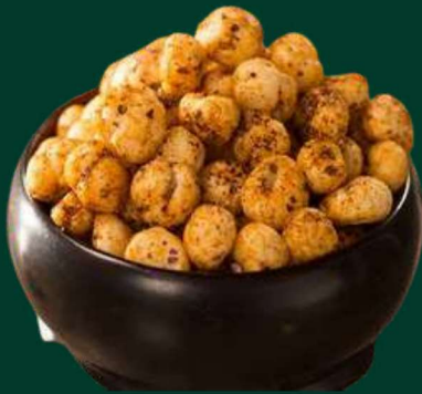
Roasted Peri Peri

Sourced directly from India's finest cultivation areas nutritious and versatile super food makhana are a popular healthy snack that is low in calories, fat and sodium while being rich in protein & fibre