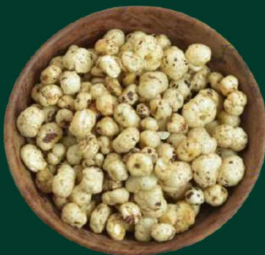
Cream & Onion