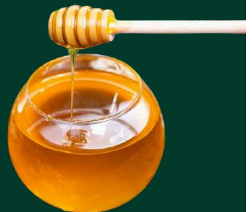
Acacia & Other Floral Varieties