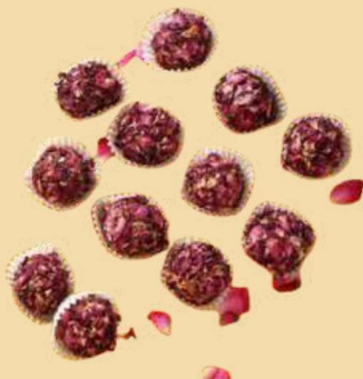
Semi circle gulukand Chocolate

Our Gulukand is a natural coolant and an Ayurvedic superfood, prepared using a slow-cooking method with natural sugar candy (Mishri) to retain the roses' nutritional benefits, natural aroma, and taste. Free from artificial flavors or preservatives range includes :