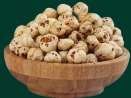
Rock Salt & Pepper

Available in : Mint, Roasted Peri Peri, Cream & Onion, Rock Salt & Pepper, Tangy Tomato