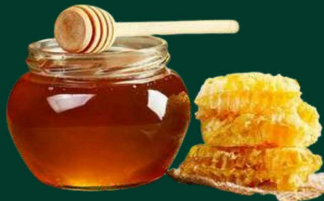
Wild Forest Honey