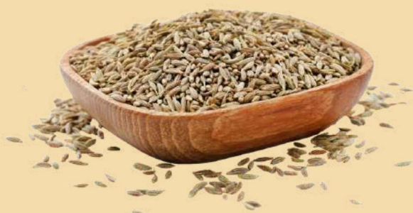
JP Gold Cumin