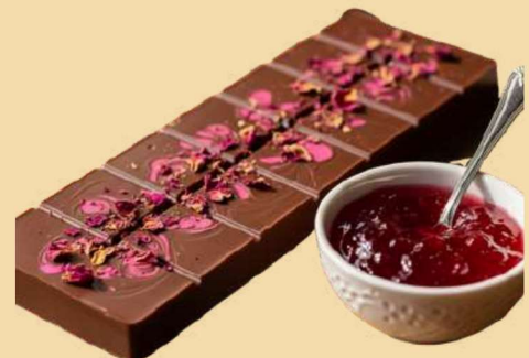
Gulkand Chocolate Bar