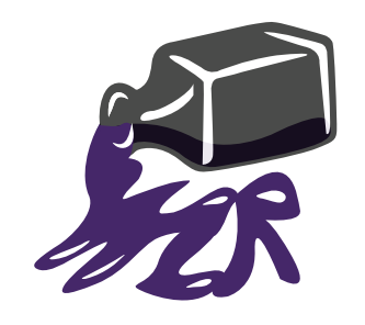
Waldorf Literary Review