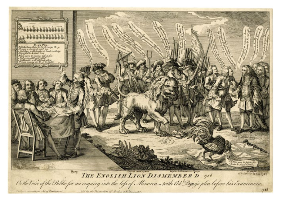
Figure 1. [Anonymous], The English Lion Dismember'd, or the Voice of the Public for an enquiry into the loss of Minorca ... (London, 1756). Published after the British loss of Minorca (represented by the lion's severed front right paw), this print also noted two locations in North America imperiled by the French: Nova Scotia and Oswego (represented by the lion's rear right and left paws, respectively).

The French had advanced practically to Albany's doorstep by entrenching themselves at Ticonderoga at the southern end of Lake Champlain. Most shocking of all, Oswego, into which the Crown and colonies had poured two years' worth of men and supplies, was a smoldering ruin. Alongside the loss of the Mediterranean island of Minorca to the French, the fall of Oswego in 1756 was a sobering failure of British arms that caused public outcry and political panic at home (Figure 1).<sup>1</sup>