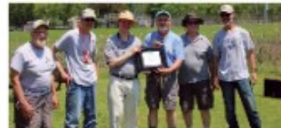
Presentation of the AMA Award of Recognition to the Somerset club officers.