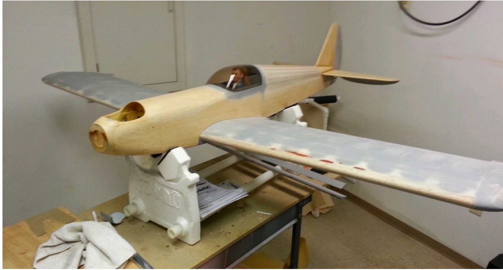
Shelly Slein built Sportster upon arrival at Tim's shop